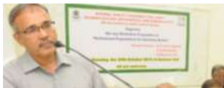
The Principal explains the functioning of IQAC