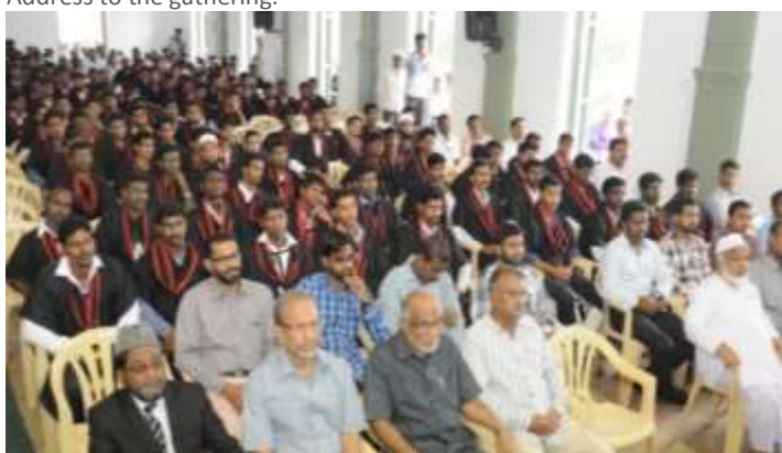
A section of Dignitaries and Young graduates during the Convocation function.