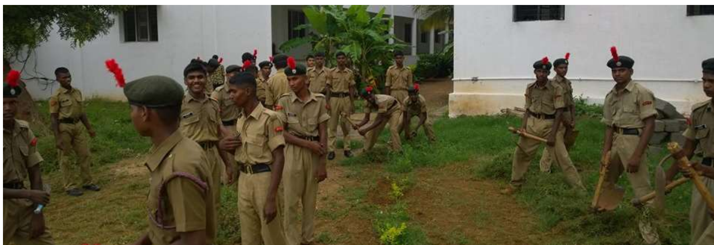
NCC Army attachment Camp at Secunderabad

"Clean India" a campus cleaning programme was organised by the NCC Cadets on 17th September 2014.