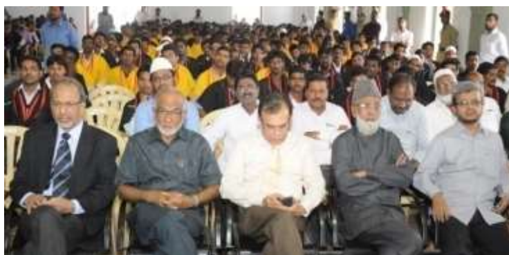
A section of Dignitaries and Young graduates during the Convocation function.