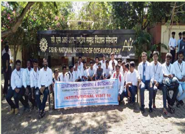
Visit to National Institute of Oceanography, Goa