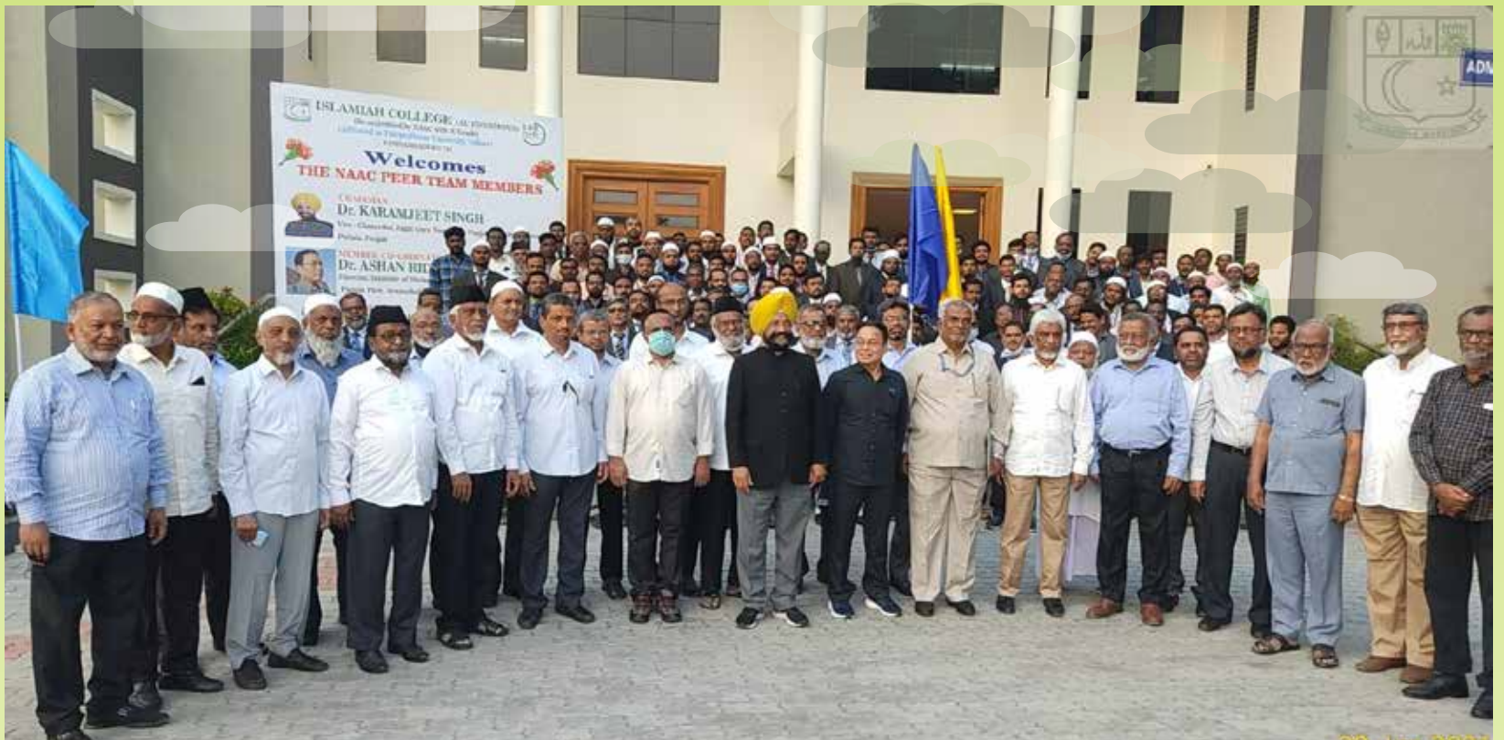
GROUP PHOTO WITH NAAC PEER TEAM MEMBERS