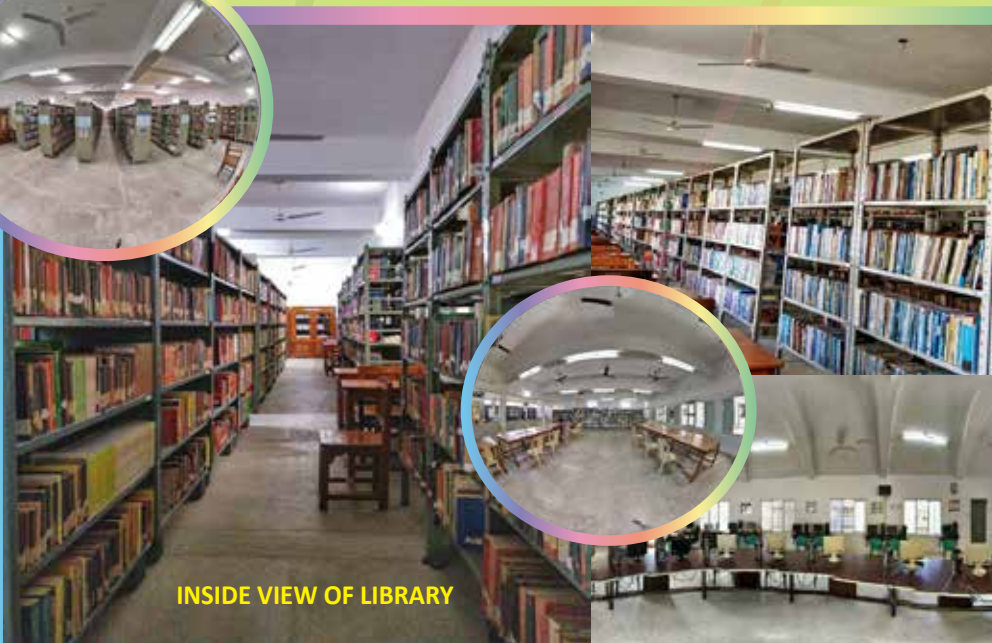
INSIDE VIEW OF LIBRARY