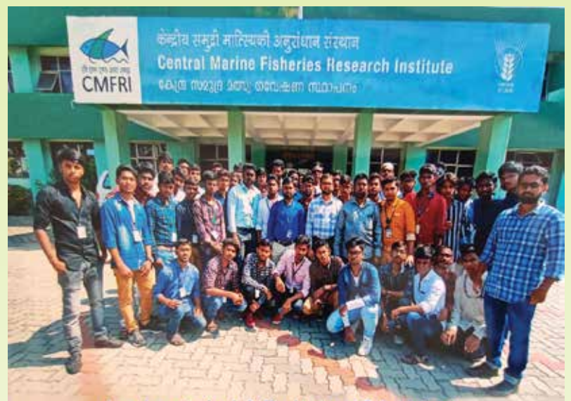
Visit to Central Marine Fisheries Research Institute, Cochin