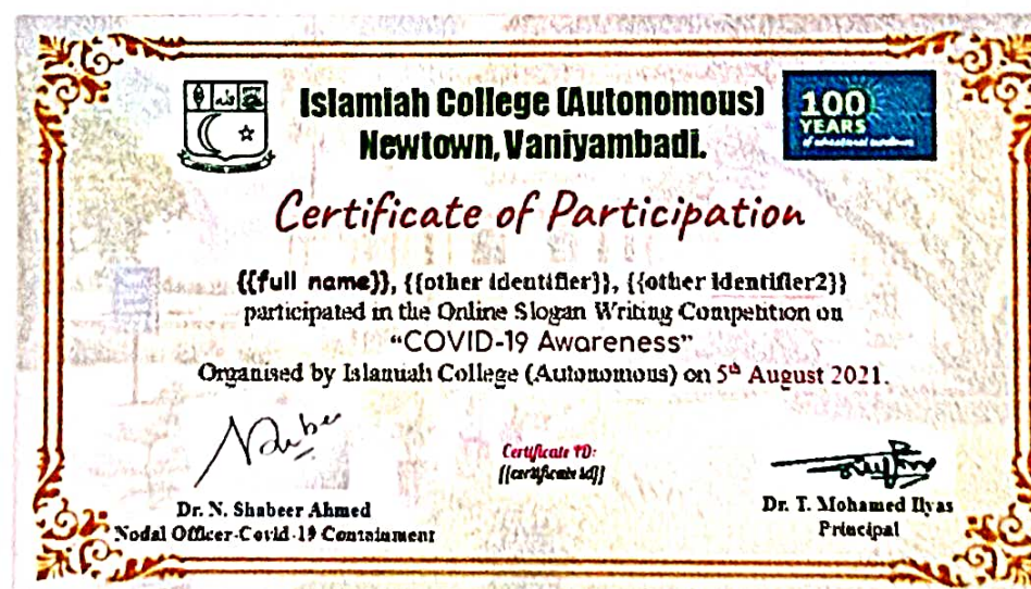
Participation e-certificate for Slogan Writing competition