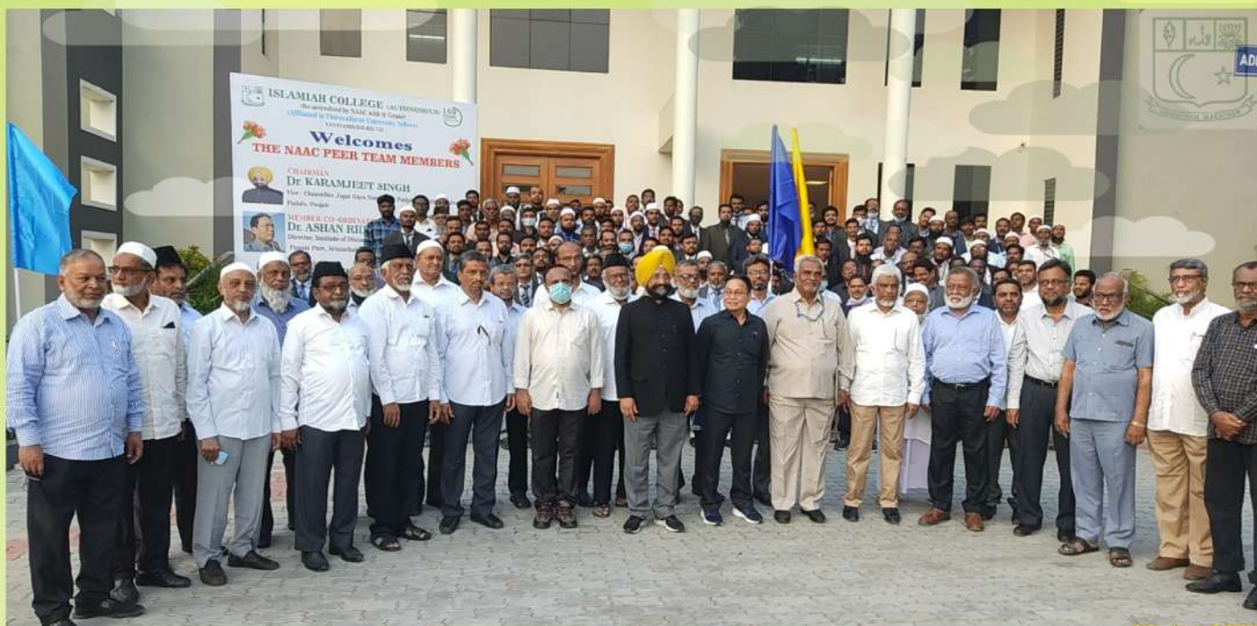
GROUP PHOTO WITH NAAC PEER TEAM MEMBERS