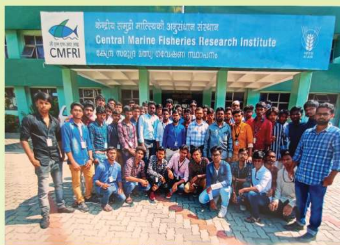
Visit to Central Marine Fisheries Research Institute, Cochin