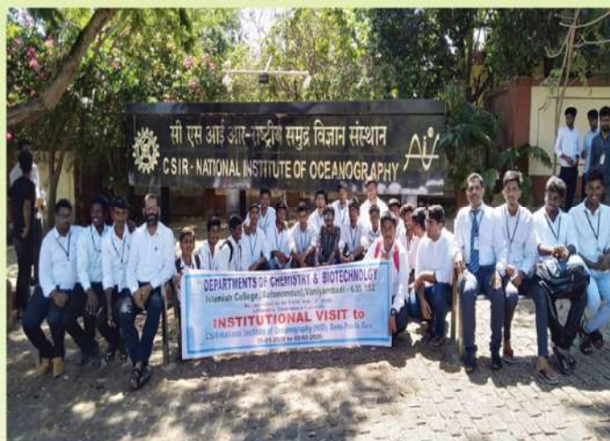
Visit to National Institute of Oceanography, Goa